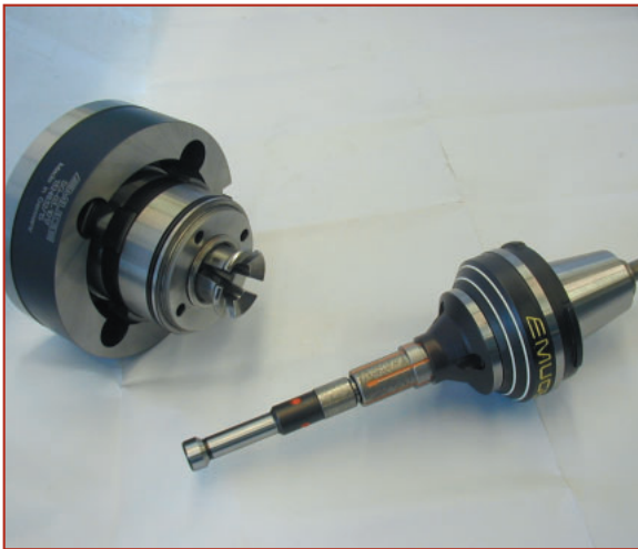
FIGURE 2— Emuge shaving arbor for a Mitsubishi FS30A synchronized shaving machine.

geometry in the machine adapter. Then, with slight rotation of the clamping device, it is now safely seated into the pre-clamped position. The design can also incorporate internal stops located in the machine adapter that would give the operator a positive feel when the clamping device is safely in the pre-clamped position.