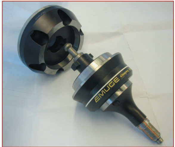
FIGURE 1 — Emuge hobbing arbor for a Mitsubishi GND10A dry hobbing machine.

“TOOL-LESS QUICK CHANGE WORKHOLDING DEVICES MEAN JUST THAT: CHANGING THE MACHINE OVER FROM ONE WORK-PIECE TO THE NEXT DOESN'T EVEN REQUIRE A WRENCH.”