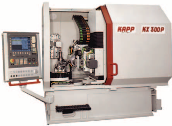
Figure 2 — For automotive industry, KAPP's KX300P uses dressable, continuous generating grinding technology.