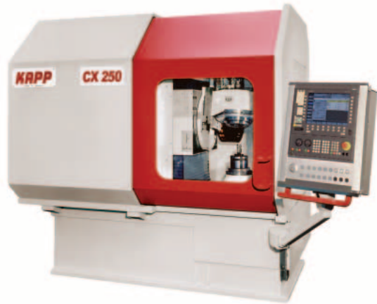
Figure 3 — KAPP's CX250 Coroning machine uses single layer plated diamond-coated rings.

amount of money in upfront purchasing costs. Using the same control systems, HMIs, and compatible parts saves an enormous amount of time and money in training and inventory, and the coupled system works as one machine to grind and hone gears in the most efficient and economical solution available in the automotive industry. 📄